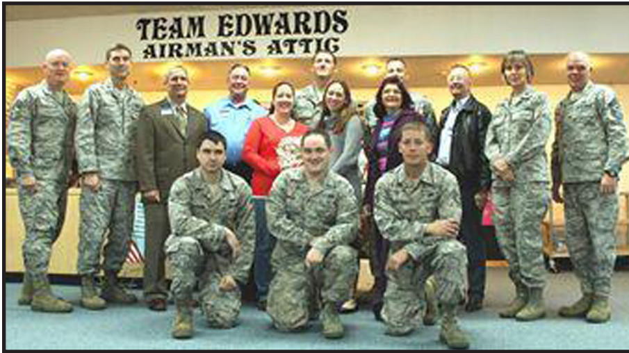
The Team Edwards' military community came together with members of the Edwards AFB Civilian-Military Support Group on November 22 to celebrate completion of a two-year project at the Airman's Attic. The Civ-Mil Group raised more than $15,000 to install new carpet in the facility, an accomplishment completed with volunteer work from members across the base.