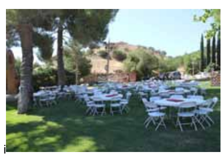
The Setup is Complete