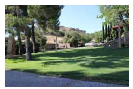
Hacienda Lane Ranch before the Setup